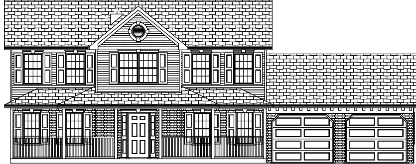
ARCHITECTURAL DETAILS OPTIONAL