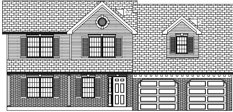
ARCHITECTURAL DETAILS OPTIONAL

14' X 10' OPTIONAL DECK OR PATIO PAD SUBJECT TO GRADE