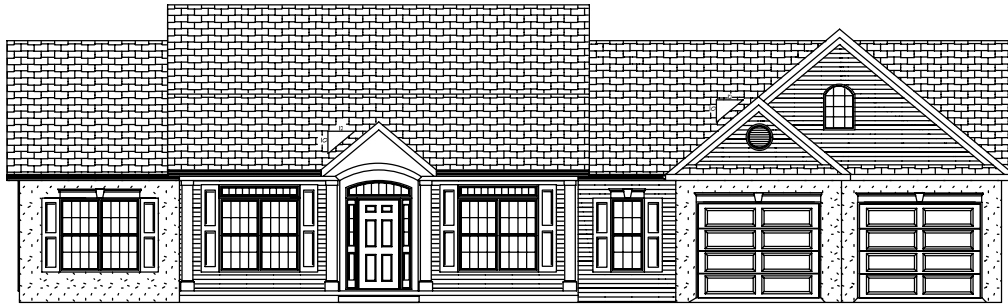
ARCHITECTURAL DETAILS OPTIONAL