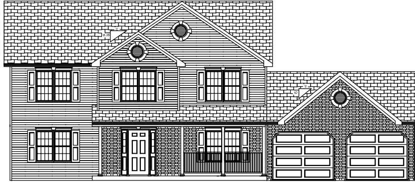
ARCHITECTURAL DETAILS OPTIONAL