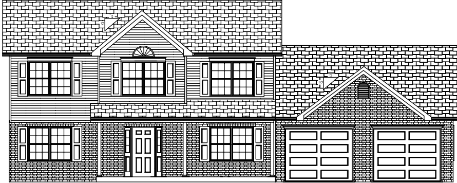
ARCHITECTURAL DETAILS OPTIONAL