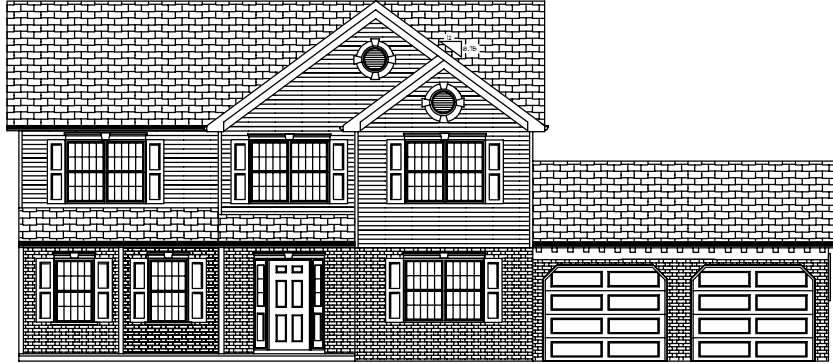
ARCHITECTURAL DETAILS OPTIONAL