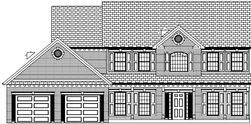
ARCHITECTURAL DETAILS OPTIONAL