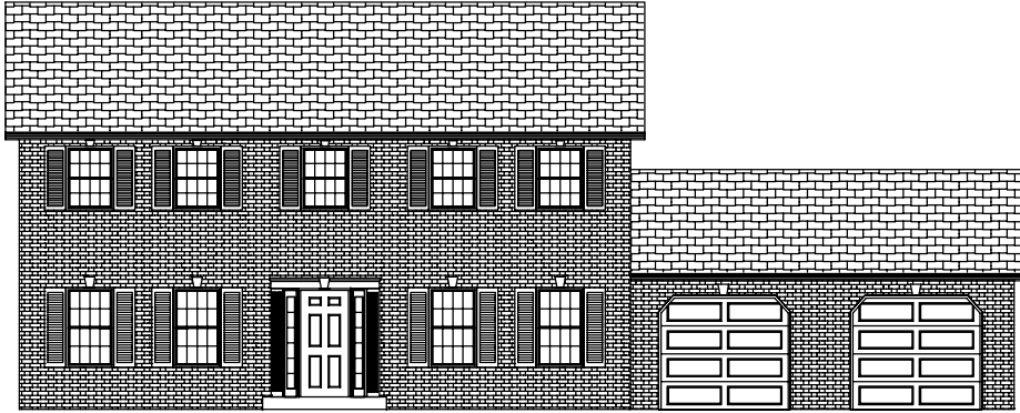
ARCHITECTURAL DETAILS OPTIONAL